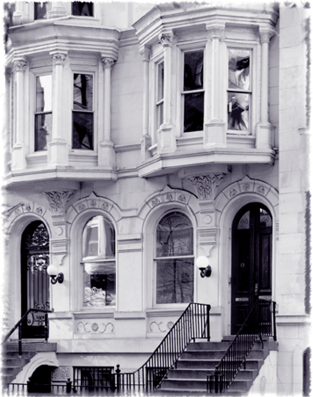
The Josiah Macy, Jr. Foundation headquarters in New York City