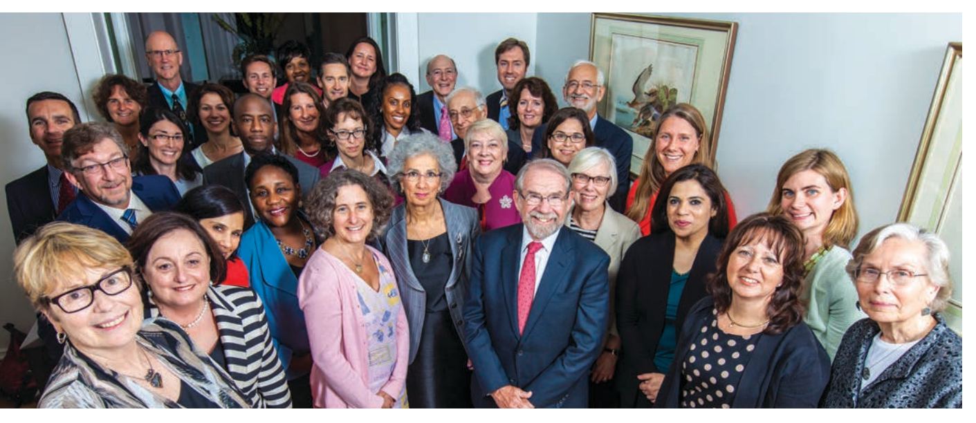
Macy Faculty Scholars 2015 Annual Meeting.