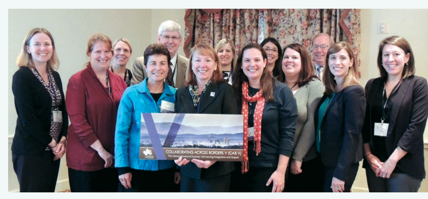
Participants at the conclusion of an interprofessional faculty development workshop conducted by the University of Washington.

the issues that lead to student and resident suicides and the increasing numbers of health professionals who opt to leave the field.