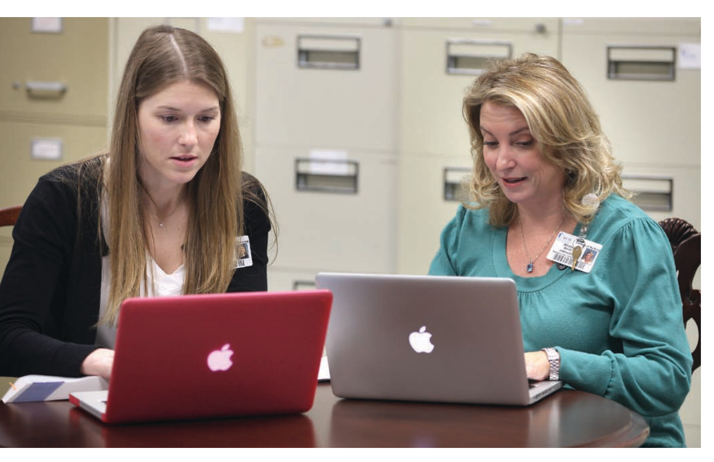
Medical University of South Carolina College of Nursing faculty beta testing the Virtual Interprofessional Project before launching it with colleagues from medicine and pharmacy.

With the dawn of big data, breakthroughs in virtual reality and artificial intelligence, an explosion in the number of smart phones and mobile technologies, and a constantly expanding universe of apps and websites, Americans are more connected than ever and answers to almost any question are only a finger swipe away.