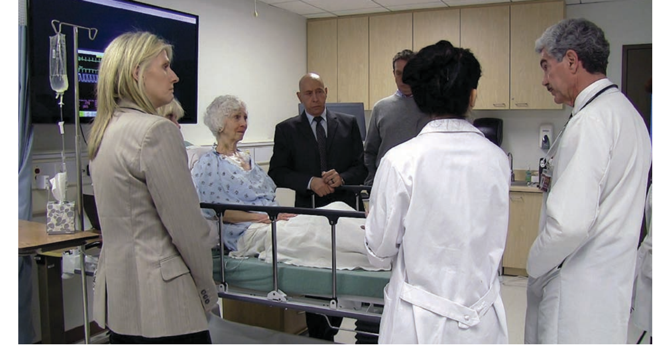
An interprofessional team of UCLA caregivers share their treatment plan at the patient's bedside.

to collaborate and work as partners with other health professionals.